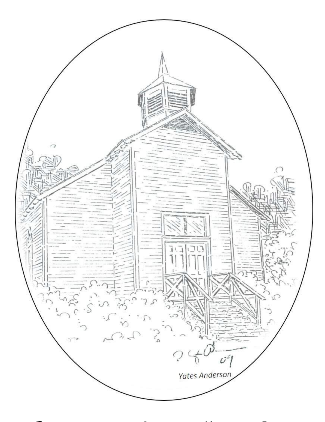
Lake Toxarvay United Methodist Church Sunday, June 2<sup>nd</sup>, 2024